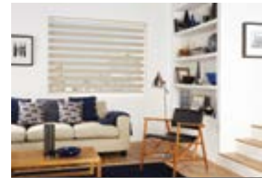
Vision/Multi Shade Blinds