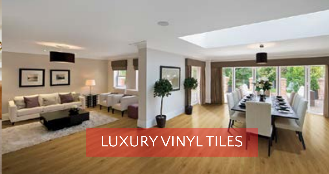
LUXURY VINYL TILES